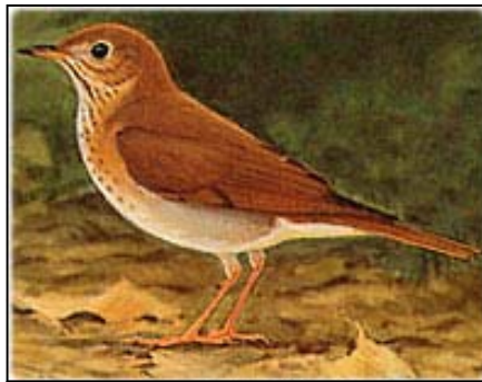
Veery