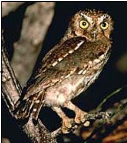
Elf Owl.

Zone-tailed hawks to Elf Owls to Black-capped and Gray Vireos to Colima Warblers to many rare strays from Mexico. Better be prepared to drive long distances and hike to see it all—but a trip here in late April will be something you will