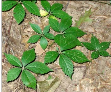
Virginia Creeper.

When mature, Virginia creeper can produce a dense tangle providing wonderful shelter. We have observed chicka-